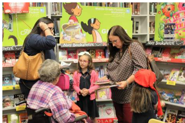
Elementary students enjoy the book fair with their grandparents on Grandparent's Day.