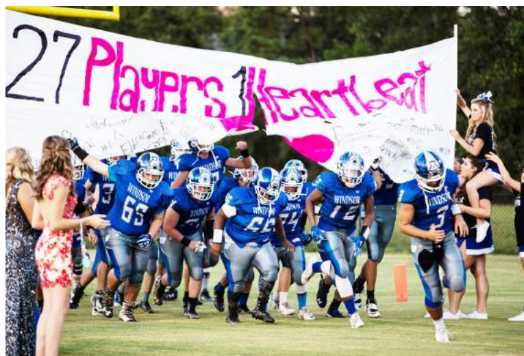
The Knights take the field on Homecoming night.

The team started out the season with a loss to Triple A school, Heritage Christian. They then won three consecutive games against Westwood school, long time rival, Covenant Academy, and Trinity Christian School of Sharpsburg. Losing to Brentwood was a devastating loss to the Knights, but that didn't stop them from refocusing and beating Georgia Christian on Homecoming night.