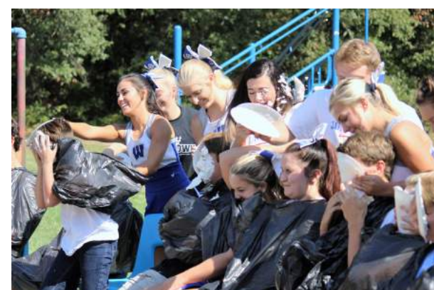
Windsor students participate in a pep rally game during Homecoming week.